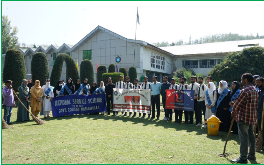
Swachh Bharat Abhiyan