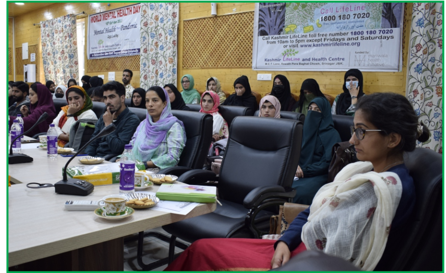
World Mental Health Day