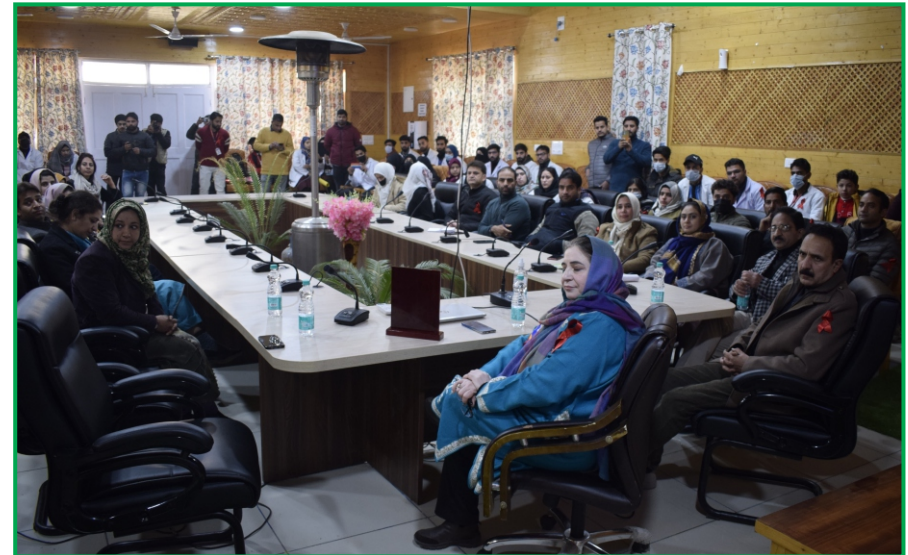
World AIDS Day