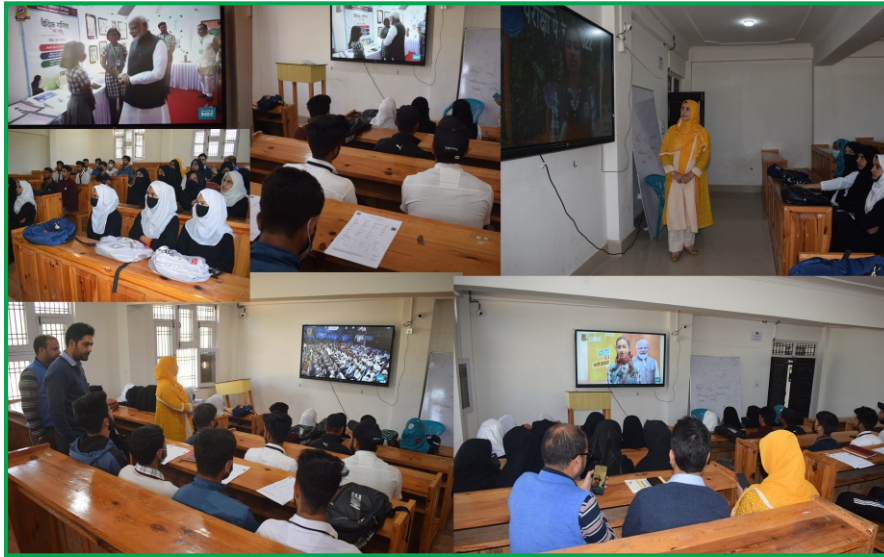
Pariksha Pe Charcha with PM