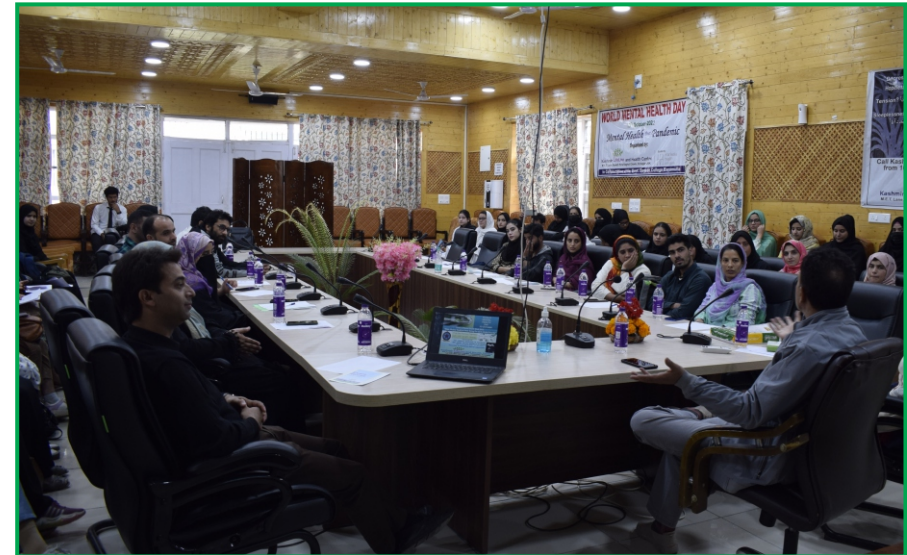
Mental Health Week Celebration