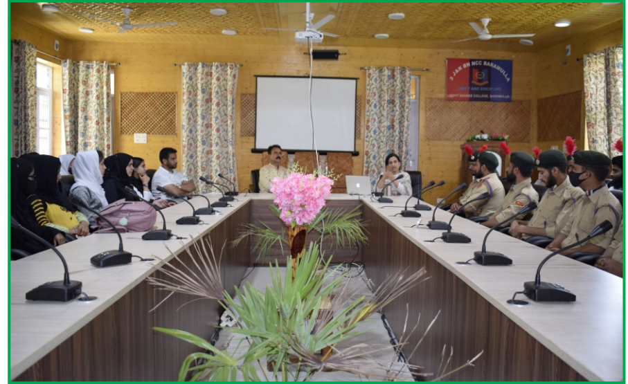
World Environment Day