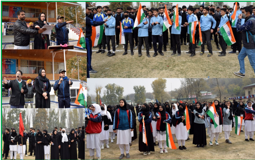
Pledge Against Substance Use