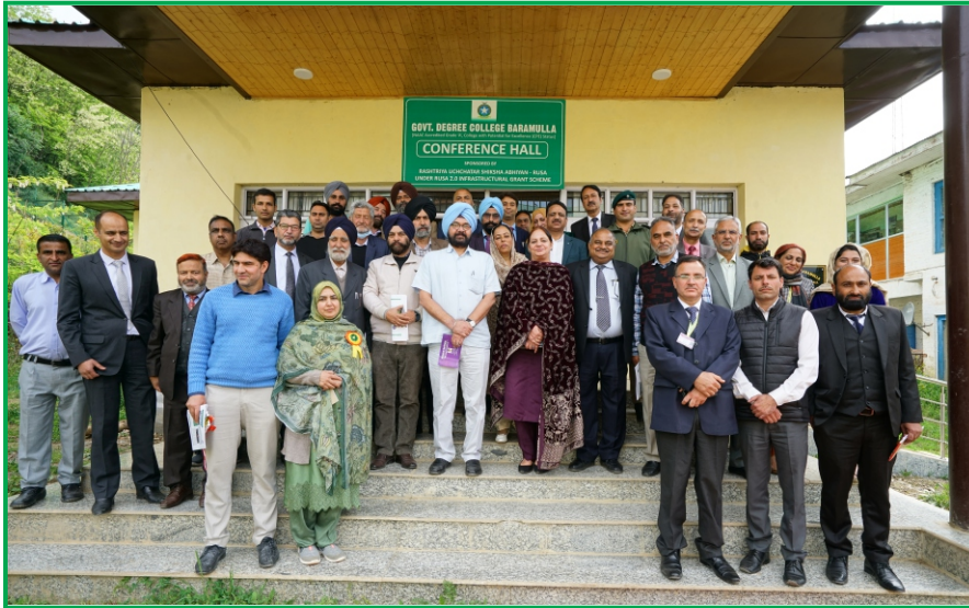
UGC Autonomous Team Visit