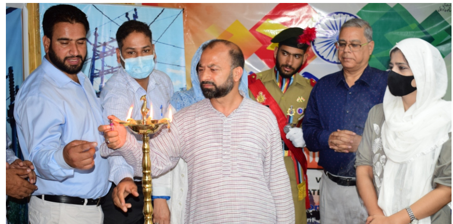
Ujjwal Bharat Ujjwal Bhavishya