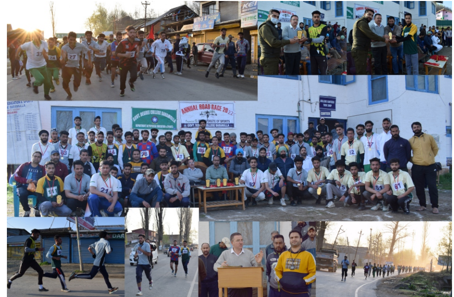
College Road Race