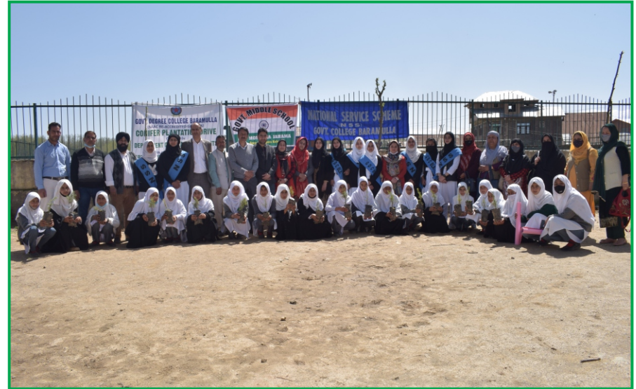
Conifer Plantation Drive at GMS Jahama