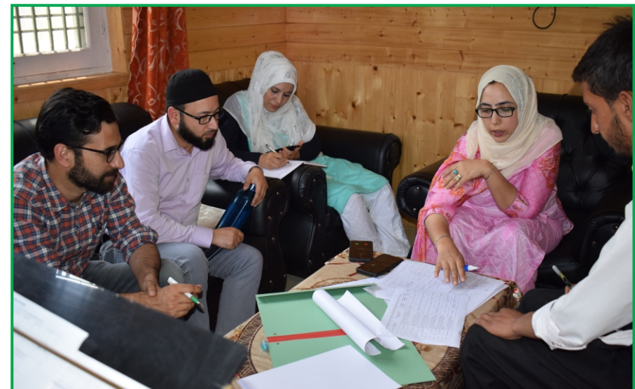
Student Induction Programme