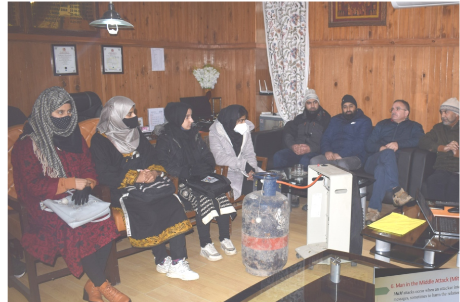
Cyber Jagrukta Divas