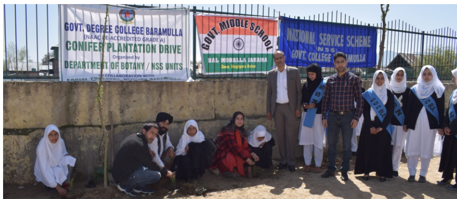
Conifer Plantation Drive by NSS at GMS Johama