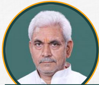
Sh. Manoj Sinha Chancellor