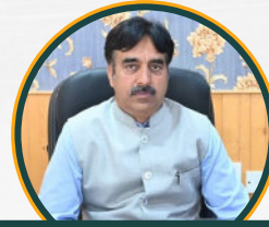
Prof. (Dr.) Nazir Ahmad Simnani Abdul Ahad Azad Memorial College, Bemina, Srinagar (School of Social Science)